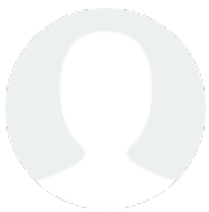
Ann Marie Rigali